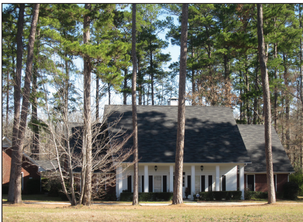
Landscaping reduces energy cost by providing shade from the home.

Firewise landscaping can be achieved along with other landscaping goals of landowners. Creating a safer Firewise landscape can easily fit into multiple goals just by using the right plants and proper spacing.