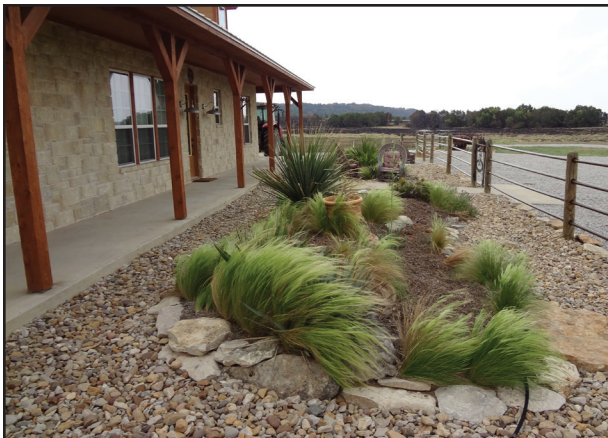
Native xeric landscaping allows water-wise practices to create a landscape that will flourish in hot and dry conditions.