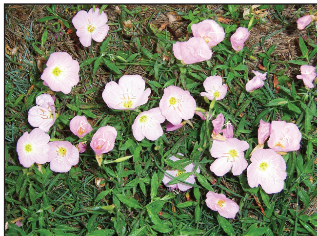
Mexican primrose, a low growing plant, helps maintain the vertical separation of fuels.