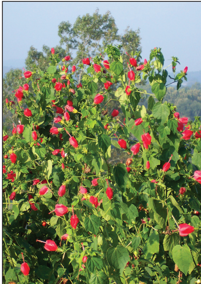
The low oil content of Malavaviscus "Big Momma" makes this plant less flammable.