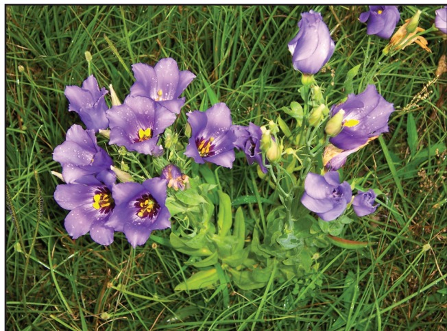
The high moisture content of the Texas bluebell makes it slower to ignite.