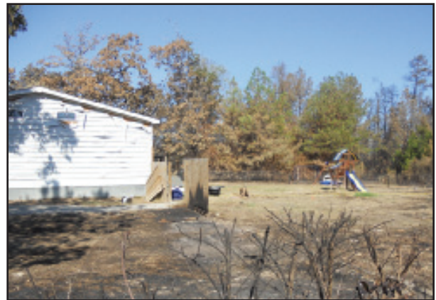
This home escaped the flames when firefighters knocked down the burning fence that would have led flames to the home. Notice the burn marks on the fence.